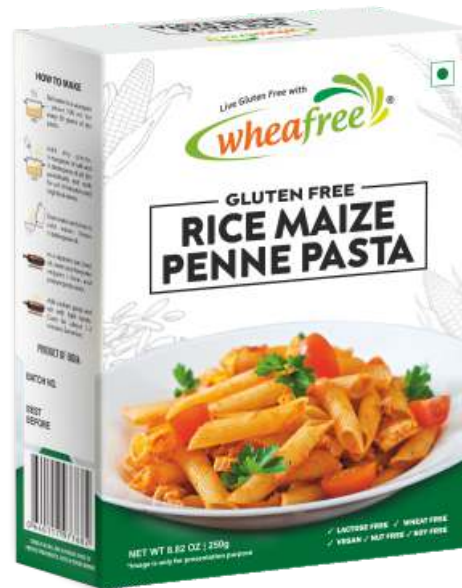
RICE MAIZE PENNE PASTA