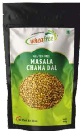
MASALA CHANA DAL